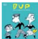
BUP • Children, IS-1301 • Young people, IS-1302 • Adults, IS-1303

Brochures can be downloaded at www.psykisk.no under Information Material.